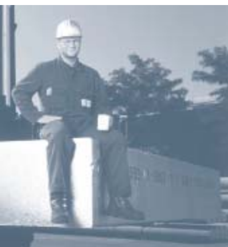
The aluminium industry is a significant economic factor and an important employer.

The German aluminium industry is an important economic factor with good growth prospects. Directly, it provides work and income for about 75,000 employees.