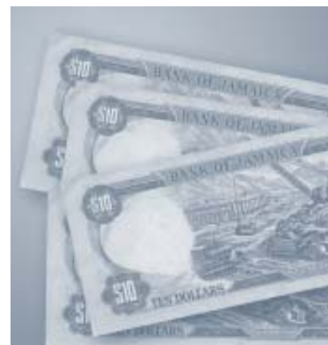
Bauxite extraction and aluminium production contribute to the economic development in certain poorer regions of the world, for example in Jamaica.