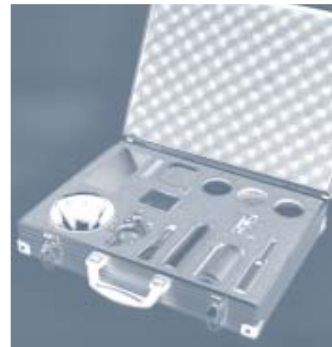
A case containing numerous teaching aids and illustrative material related to aluminium is one of the many items offered by the aluminium industry and the AIS (Aluminium Information Service).

Together with teachers from the School/Industry Working Group, the Germany-based Aluminium Association (GDA) produced teaching material some years ago. This included texts, overheads and a teaching case full of illustrative material on the subject of aluminium. Project sheets suitable for schoolchildren are currently being developed in cooperation with the Chair of Didactics at the University of Erlangen-Nürnberg. The whole range of teaching materials was presented to a broader public at Education Fair 2001 in February 2001.