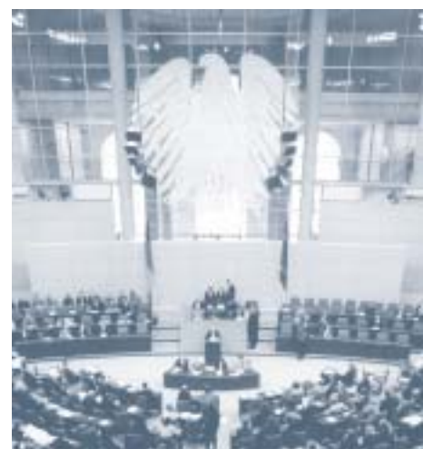
An eagle – Germany's national emblem – made of aluminium, in the Lower House of Parliament.