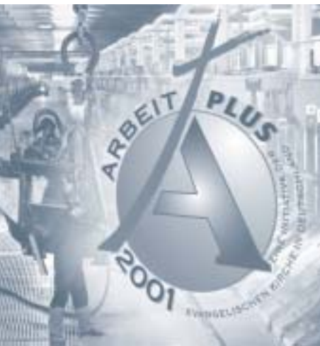
Awards are made to companies that demonstrate a special commitment to the social aspects of work and employment, for example by the Evangelical Church of Germany (EKD). Two companies from the German aluminium industry have been awarded the EKD's "Arbeit Plus" (Work Plus) seal.

Today, safety at work is an integral part of the management system. As with environmental protection, in all companies that operate globally, the rules for safety at work usually apply on a company-wide basis. Systematic auditing, clearly defined standards and binding guidelines define the main requirements in the plants for safety at work from an organisational and technical point of view. Lots of companies have specifically stated that it is their intention to reduce work-related injuries and sickness to zero, and have increasingly met this target in recent years. To ensure that this remains so, many companies are also planning to check their safety standards regularly via audits.