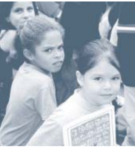
Apart from measures to rehabilitate bauxite mining areas, a large part of the social measures is devoted to children, such as the setting up of schools.

of bauxite mines. This applies, for example, to the landscaping, road-building projects and medical care. Among other things, the aluminium industry has awarded the Aborigines long-term contracts for the transport of bauxite or the provision of seeds for land recultivation. This ensures that the native inhabitants have a reliable source of income for decades. 5