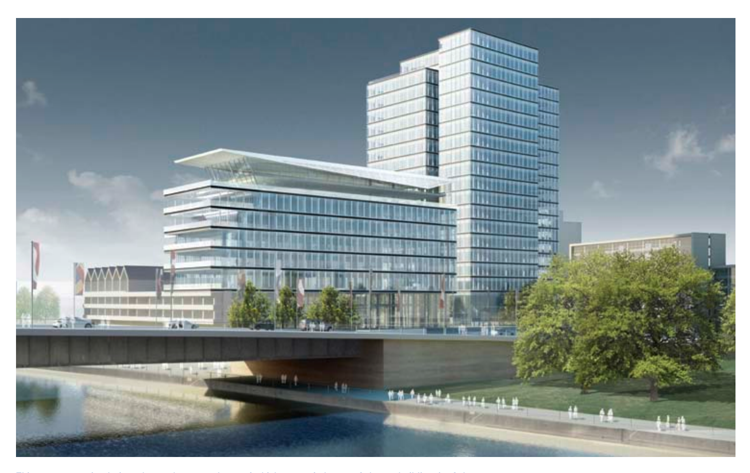
This computer simulation shows the exemplary refurbishment of the maxCologne building in Cologne, which is due to be completed in 2013.

and cooling ceilings. The project has already been awarded gold pre-certification by the German Sustainable Building Council (DGNB). The aim is to achieve gold certification on completion of the revitalisation measures.*