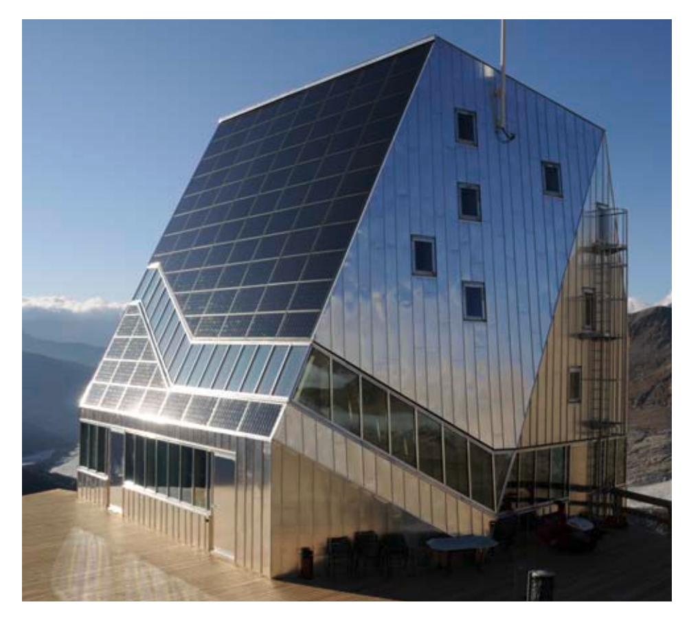
Aluminium offers more than just a roof over one's head, even under extreme conditions; the Monte Rosa mountain hut, which has won an award for self-sufficiency, is shown here.

As the third most abundant element in the Earth's crust, nature's reserves of aluminium are almost inexhaustible. Once aluminium products have entered the production loop, they can be melted down again at the end of their useful life an indefinite number of times without any loss in