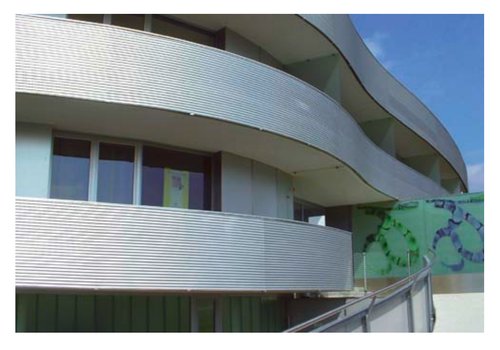
Aluminium façade elements offer many benefits - functionally and visually.

Aluminium is characterised by an excellent strength-to-weight ratio – it is light but neverthe-less very strong. This favourable combination of-