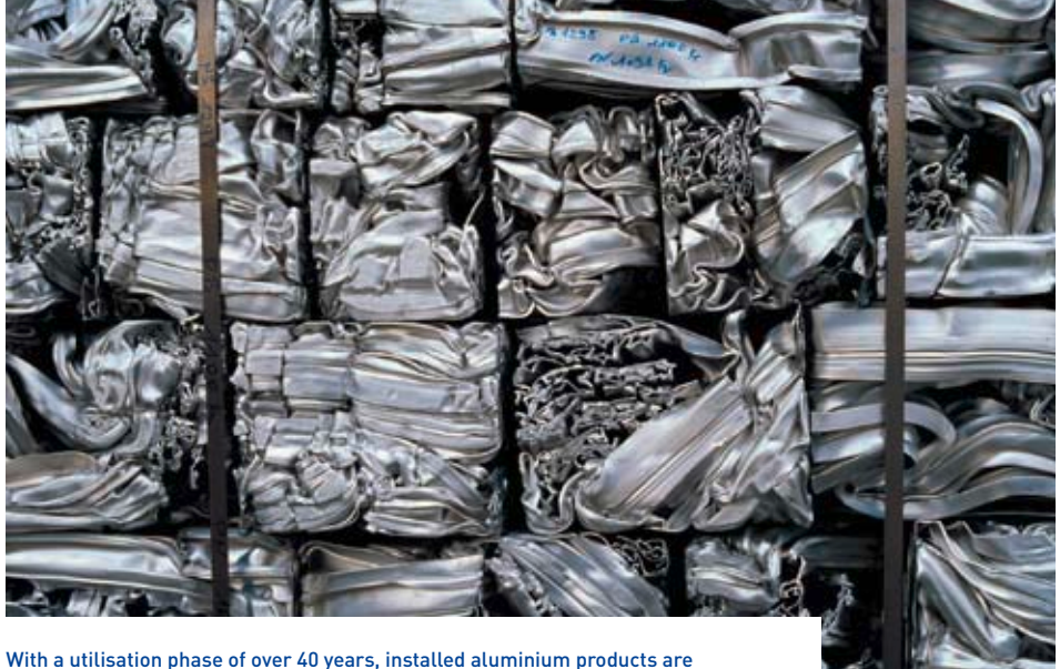
also a good source of "raw materials" in the long run.

At the end of a building's useful life, one has to consider demolition and the recycling and disposal of the building materials. Intelligent refurbishment of buildings also helps conserve resources. An example here is the maxCologne office building in Cologne. This former Lufthansa skyscraper is to get a new building envelope and new building services by 2013. The technical standard and concept for energy efficiency are in keeping with the criteria for green building. The building will not only use less energy but will also utilise energy from renewable resources: ground water will be used to maintain the temperature inside the offices without draughts using heating